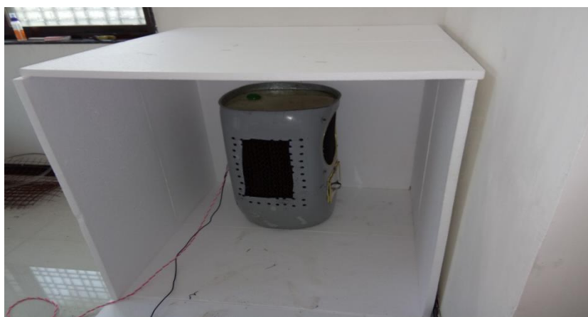
Fig. Thermocol room

In this project, we have designed a small model of cooler. So, instead of considering the room area first, directly a small model of the direct evaporative cooler is designed and developed by making some design considerations for finding out the capacity of a fan to be used in the desired model. And finally, according to the size of the developed model, a room of thermocol is prepared which is having a size slightly larger than that of the model of the cooler. All the readings of the developed model of the cooler are taken inside the thermocol room prepared, in order to analyze the cooling effect of the cooler properly.